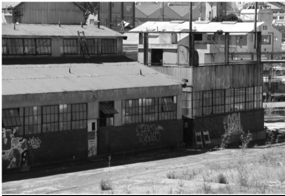
(Building 50 is the structure at the right)